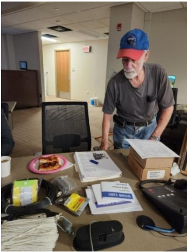
←My “Left Brain” as DARC Pres.